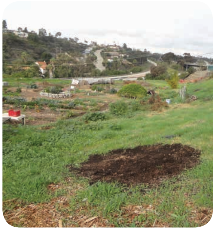
A view from the new Peace Garden site overlooks the 805 freeway.