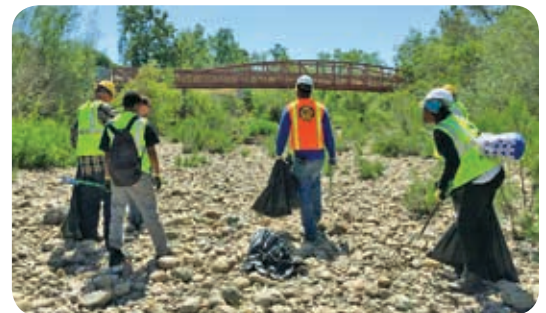
Our six-person work crew beautifies the area outside the Jacobs Center for Neighborhood Innovation in Chollas Creek. Second Chance was awarded a work contract in mid-March to help unemployed local residents find short-term work and earn a paycheck.