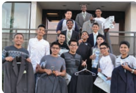
Participants in nonprofit college prep program Reality Changers show off the free suits they found in Second Chance's professional closet.